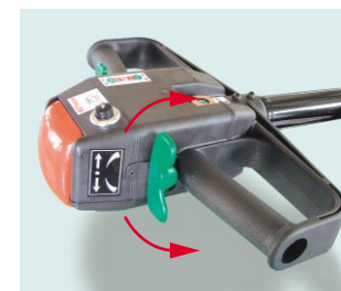
Easy Control Lever Easy and Smooth Driving with Finger Control