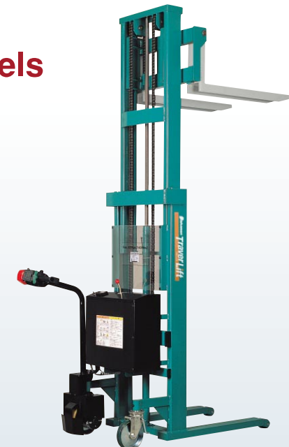
Lifting Height 2420 Type