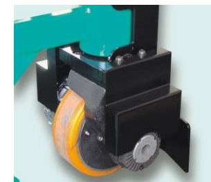
Compact Drive unit