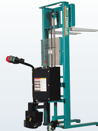
Lifting Height 1500 Type