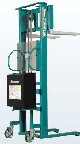
Lifting Height 1500 Type