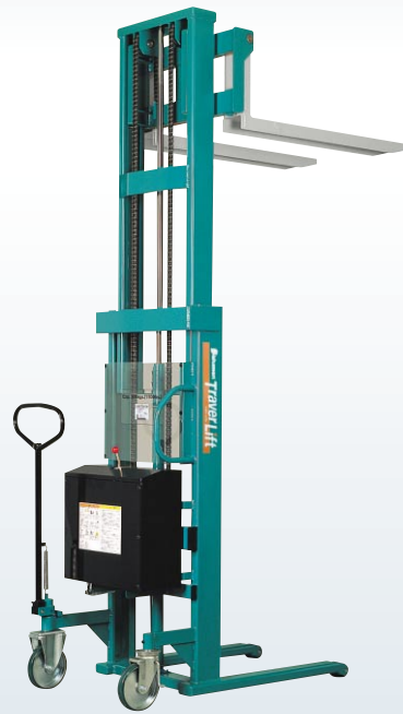
Lifting Height 2420 Type