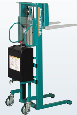
Lifting Height 1200 Type