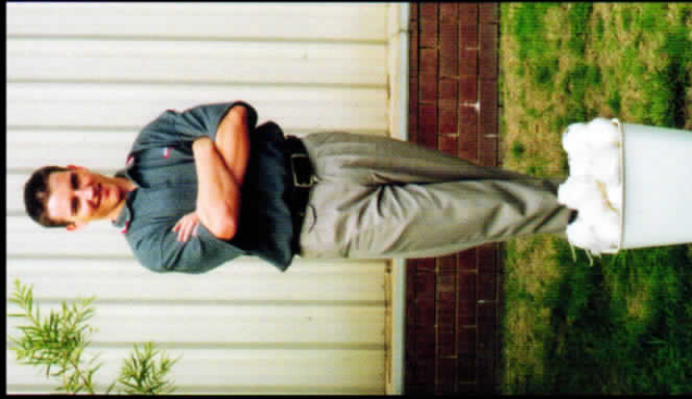
Waste stretch tape from 50 pallets