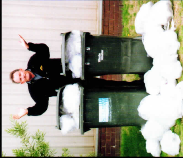
Waste stretch film from 50 pallets

Choosing any other system would be a waste